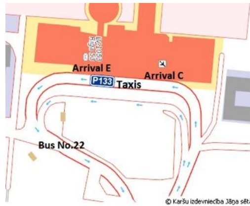
Bus and taxi stops at the airport